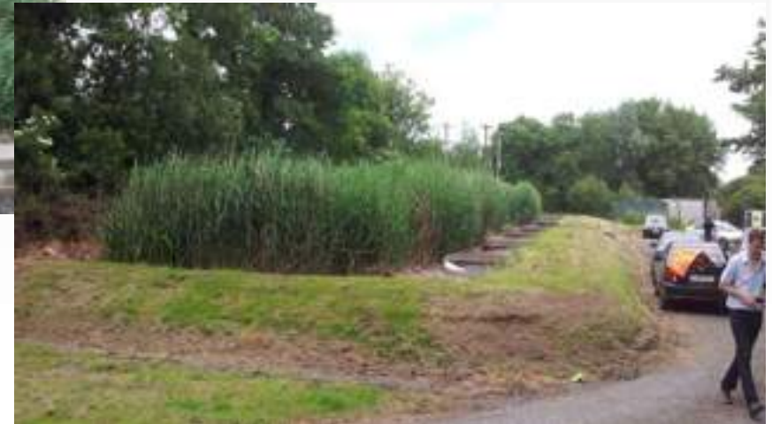
Integrated Constructed Wetlands